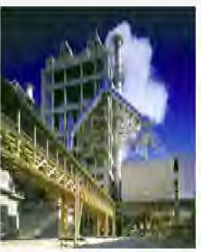
Cement production consumes a lot of limestone and emits CO<sub>2</sub>