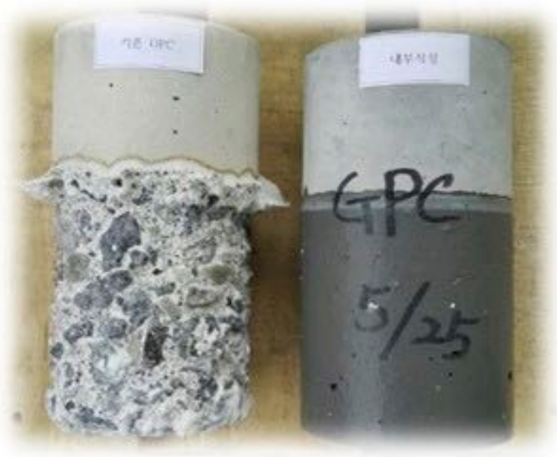
Conditioned in 2% H 2 SO 4 solution