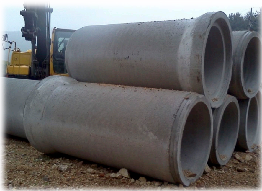
Concrete Sewer Pipes