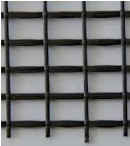
Carbon Textile Grid