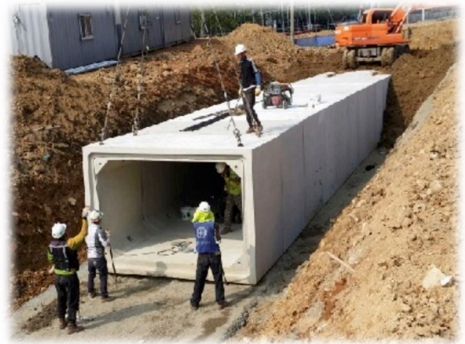
Concrete Sewer Box