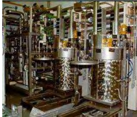
In Drum drying