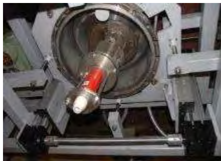
Continuous flow mixer